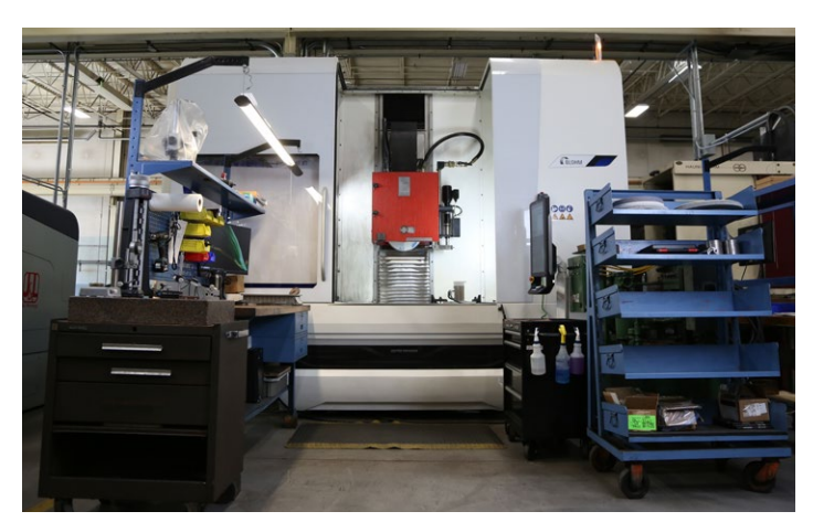
The BLOHM PROFIMAT XT purchased at IMTS 2022

Abrasive West didn't waste any time. The BLOHM PROFIMAT XT now on their floor was the very same machine that was at the UNITED GRINDING IMTS booth.