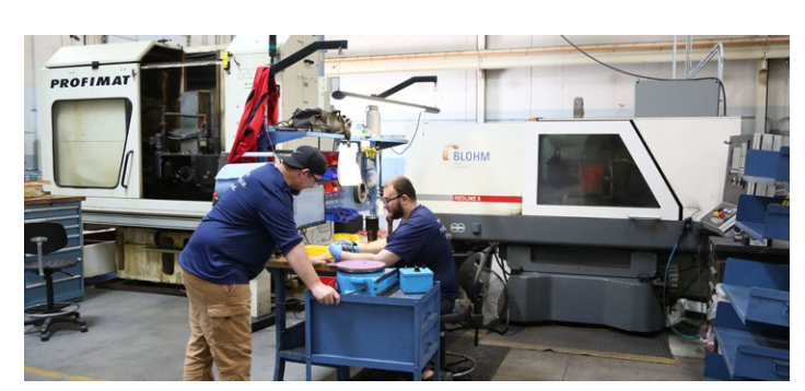
Two of the seven BLOHM machines at Abrasive West

All seven of the BLOHM machines will be ready too, as will the dedicated Customer Care support team at UNITED GRINDING North America. We can't wait to see all that Abrasive West accomplishes over the coming years.